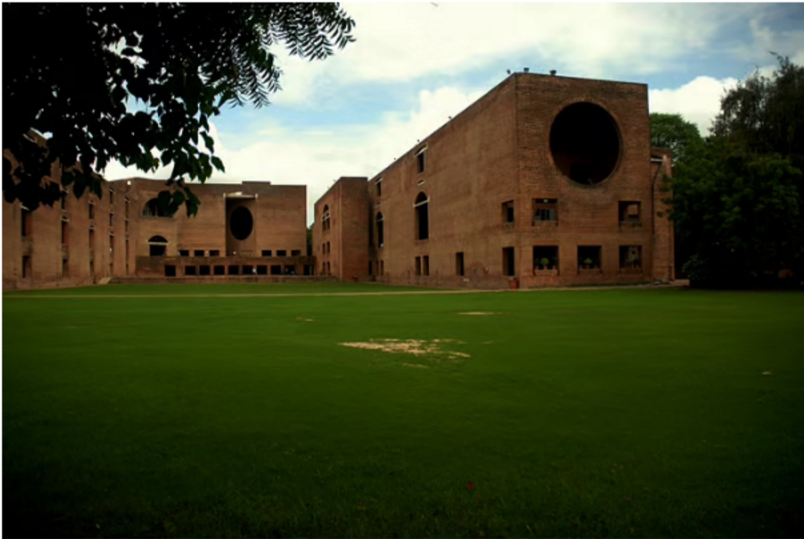
IIM-Ahmedabad old campus.

Regular recruiters like Asian Paints, CavinKare, HUL, IndiGo, ITC, Lenovo, Nestle, Reckitt Benckiser and Samsung, Wipro were the prominent names. Other recruiters included the CK Birla Group, RIL, Flipkart and Bharti Enterprises, IIM-A said in a statement.